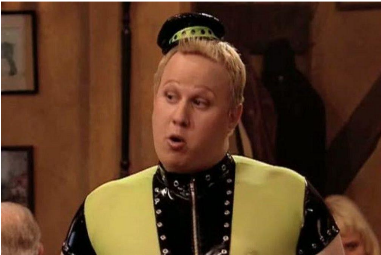
Matt Lucas as Daffyd Thomas (BBC)

Whatever our concerns about free expression, this is no time to be arguing the nuances of which kinds of blackface might be more or less acceptable. When the streets are burning with justified anger at the continued disregard for black life, it makes sense to remove the most blatantly offensive racial depictions and postpone such discussions indefinitely. As their creators' acknowledge, this includes some of the sketches in Little Britain .