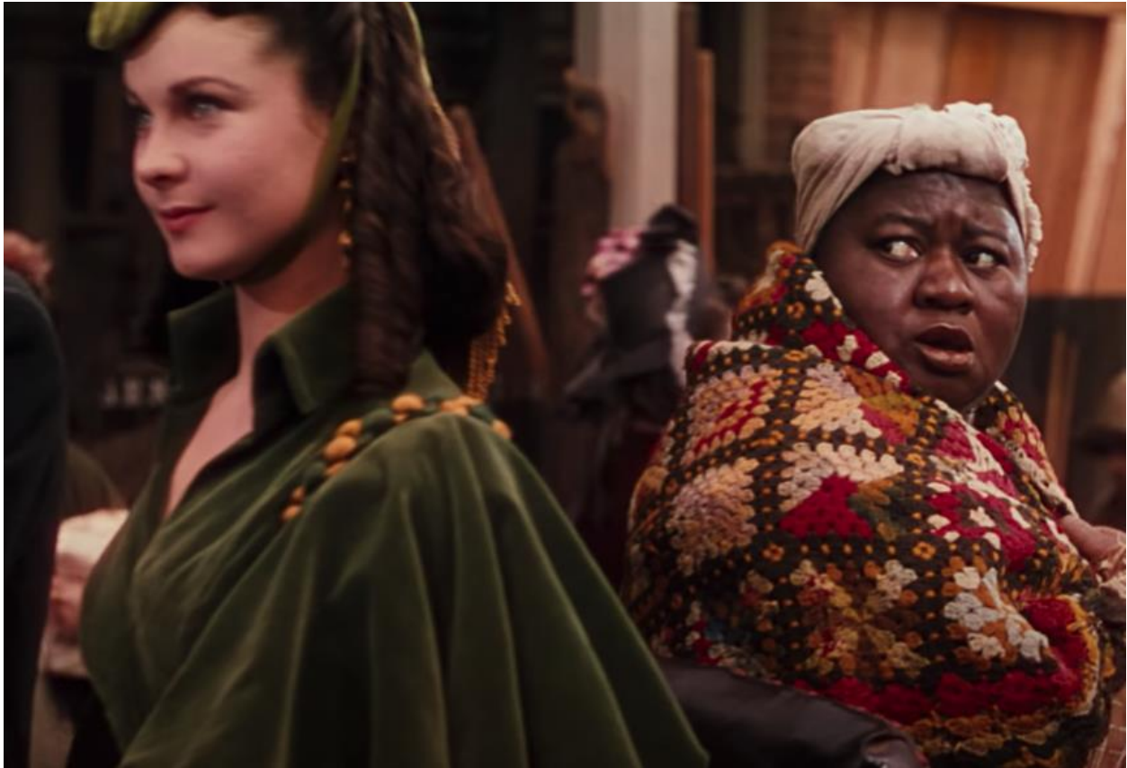
Vivien Leigh and Hattie McDaniel in the 1939 movie, which has been criticised for perpetuating insensitive racial depictions and glamorising slavery

and social certainties from their pedestals and shows them to us in all their silliness and human frailty.