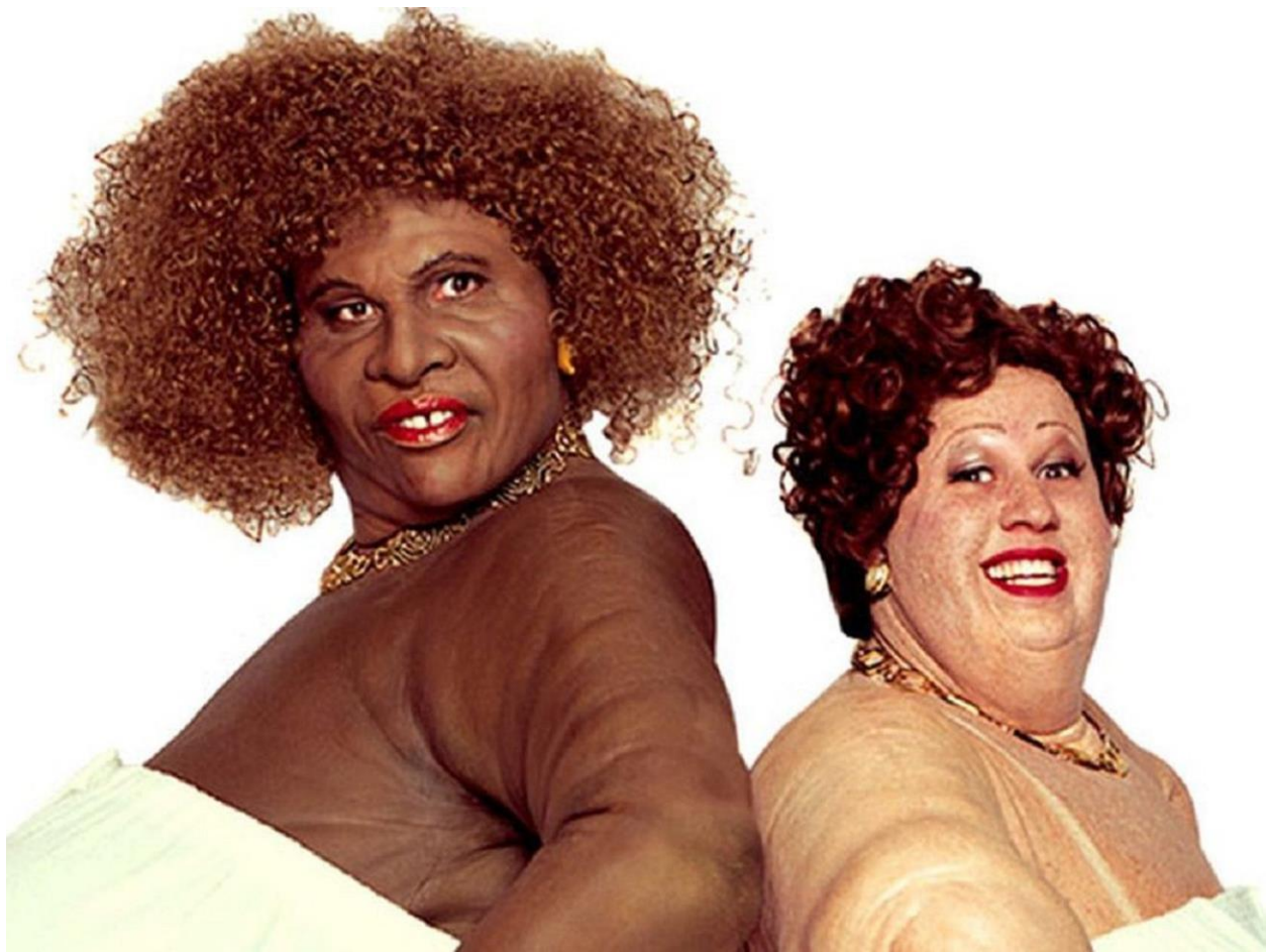
David Walliams and Matt Lucas as Little Britain characters 'Desiree and Bubbles Devere'

Another feature of the rule is that it's asymmetric. It's more acceptable for black people to make fun of white people and for gay people to make fun of straight people than vice versa. This can be attributed to the history of oppression and the ongoing power differential. For white people to make fun of black people is to add insult to injury; for black people to make fun of white people is to fight the power.