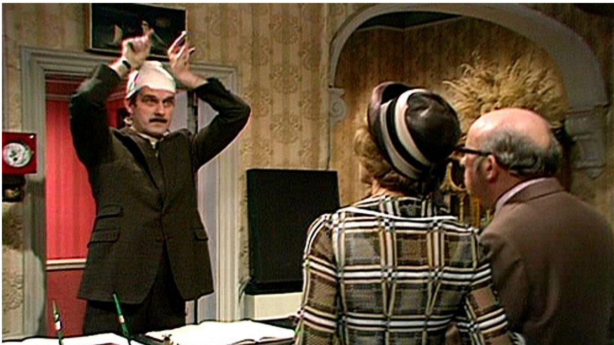
Don't mention that episode: the BBC removed a 1975 episode of 'Fawlty Towers' because it contains 'racial slurs'. It has since been reinstated with a warning

In practice, however, rules of thumb have evolved to distinguish well-intentioned ridicule from deliberate aggression. One such rule is that you can make fun of your own group but not of others. Interestingly, this rule seems to be observed on a sliding scale: most strictly of all regarding race and ethnicity; less strictly regarding sexual orientation and physical features; even less strictly regarding nationality and social class; and not at all regarding gender (in the old-fashioned, binary sense of men making fun of women and women making fun of men).